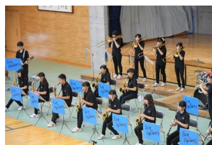
Brass Band in concert.