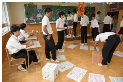
Student-run activity during the Culture Festival.

Our families, friends, and even some local residents visit Shibata High School for the culture festival; it’s a very important part of our local heritage.