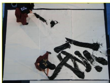
Calligraphy Club in performance